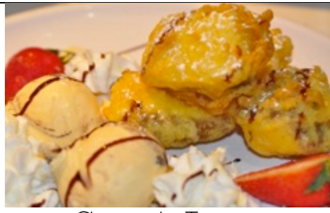
Cheesecake Tempura Ice Cream $6.95