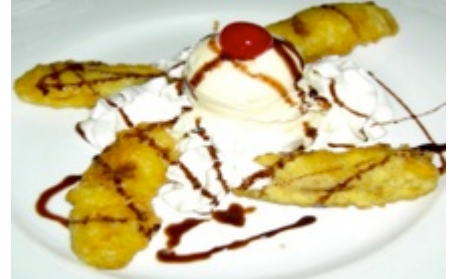
Banana Tempura Ice Cream $6.25