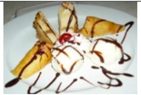
Banana Cheesecake Tempura Ice Cream $6.95