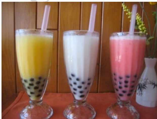
Mango | Coconut | Strawberry | Taro | Red Bean $4.25