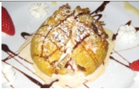
Tempura Ice Cream $5.95