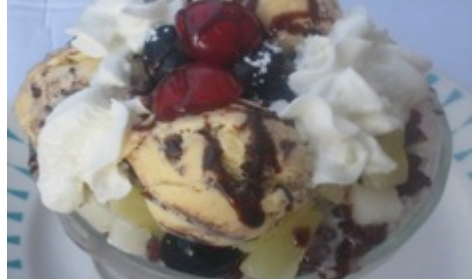
Pot Bing Su (과빙수) Korean Dessert $6.95