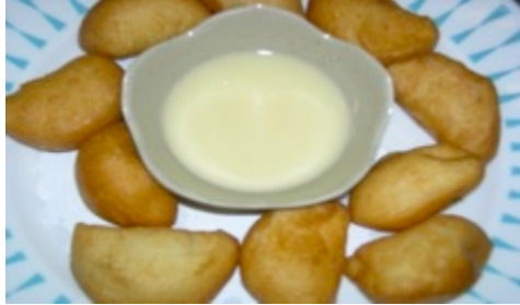
Thai Donut $4.75