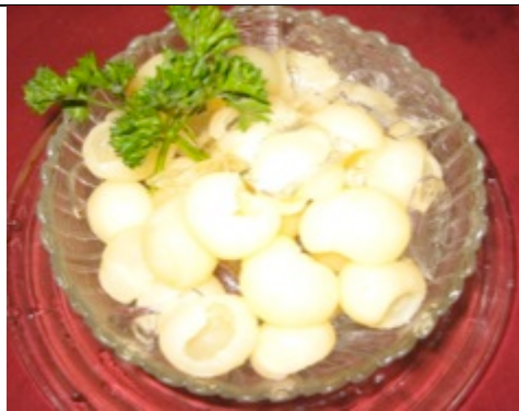
Longan Lychee $ 4.95